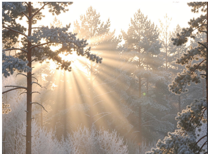
"Light shines through the darkness for the upright." Ps 112:4

Fifth Sunday in Ordinary Time February 8, 2026