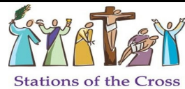
Stations of the Cross