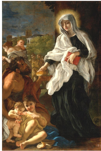
Saint Frances of Rome 1384-1440